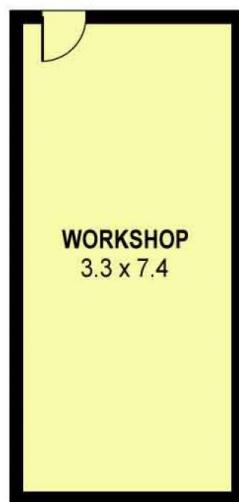
DETACHED LOWER LEVEL