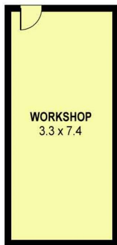
DETACHED LOWER LEVEL